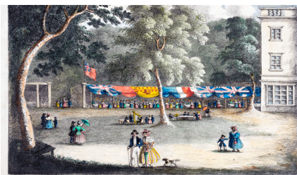
Sydney Garden Supper Box The remaining Supper Box is the one on the far left